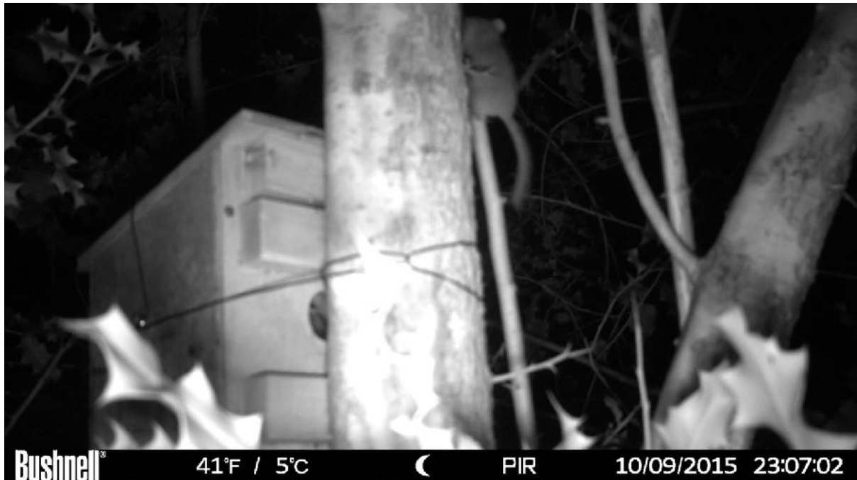
Dormouse captured on camera (see tail top centre)